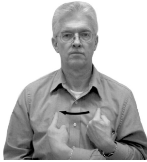
Fig. 2. ASL pronoun we .

the included referents for plural pronominal reference, so first person plural reference is expressed with a point to the signer followed by points to the other referents rather than a lexicalised first person plural form (De Vos, 2012; Marsaja, 2008). IPSL has a ‘transnumeral’ pronominal sign (an extended index finger pointing sign) which can be used for singular and plural; a point towards the signer’s chest can refer to the signer or the signer plus others, depending on the context. McBurney (2002) uses the existence of this transnumeral form in IPSL to argue against person distinctions, claiming that if there were a grammatical difference between first and non-first person in IPSL, then one might expect that number marking would also reflect first/non-first distinctions and goes on to argue against first/nonfirst distinctions across all sign languages in general. We agree with McBurney that there is insufficient evidence to posit a first/non-first distinction in sign languages which appear to lack a lexicalised first person plural pronominal sign, such as IPSL (and also Kata Kolok) but would argue that the lexicalised first person plural pronominal sign in sign languages such as BSL and ASL constitutes good evidence for a distinction between first and non-first person in the plural. However, given the arguments above, we see no convincing evidence for a first/non-first distinction in the singular for pronominal signs in any sign language described to date.