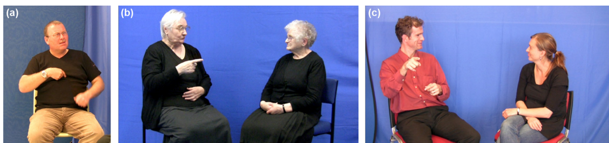
Fig. 1. (a) Pronominal sign directed to signer; (b) pronominal sign directed to addressee; and (c) pronominal sign directed to non-addressed referent.

the syntactic distribution of pointing signs (Meier and Lillo-Martin, 2010). Thus, in terms of Evans and Levinson's claim that sign languages use pointing instead of pronouns, we concluded that this assertion was too simplistic and that more research was needed.