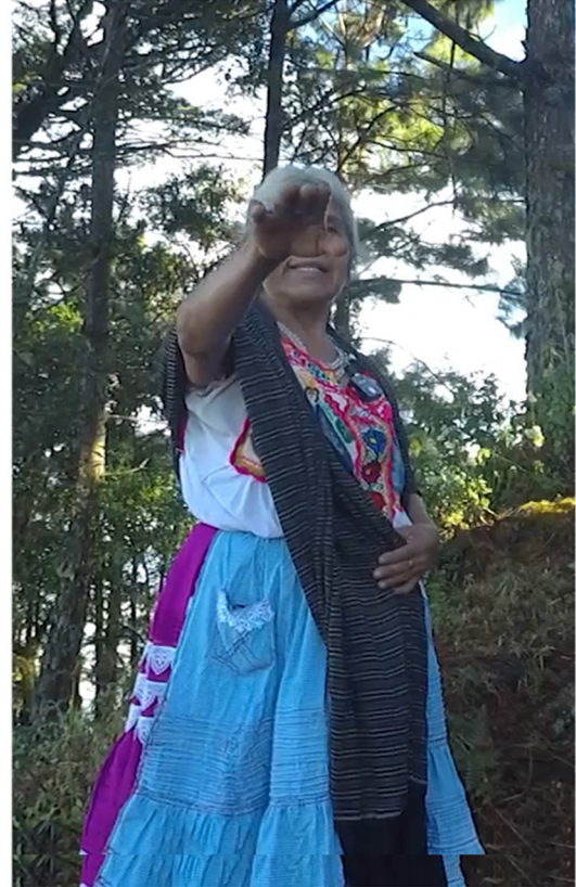
FIGURE 5 | District scale [target: Santa Catarina Juquila].

Catarina Juquila, a district scale target, she indicates the town using the proximal demonstrative nde C and a point with a raised elbow (Example 5b, Figure 5). When indicating Rio Grande, a state scale target, she uses the neutral demonstrative kwa F and a point with a raised elbow (Example 5c, Figure 6).