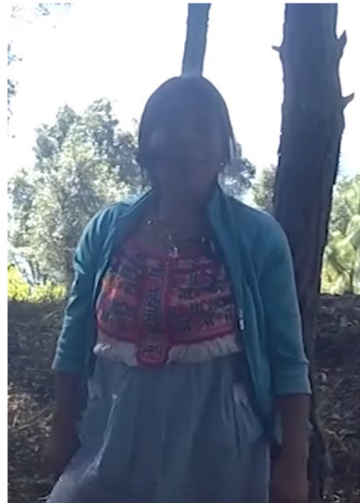
FIGURE 7 | Dem. + chin point [target: Oaxaca].

they showed a strong preference for using a speaker-proximal demonstrative form. Again, this preference was influenced by target distance: the farther the target from the speech dyad, the stronger the preference. In this case, the preference grew stronger as the scale size increased. We illustrate these findings in the following examples.