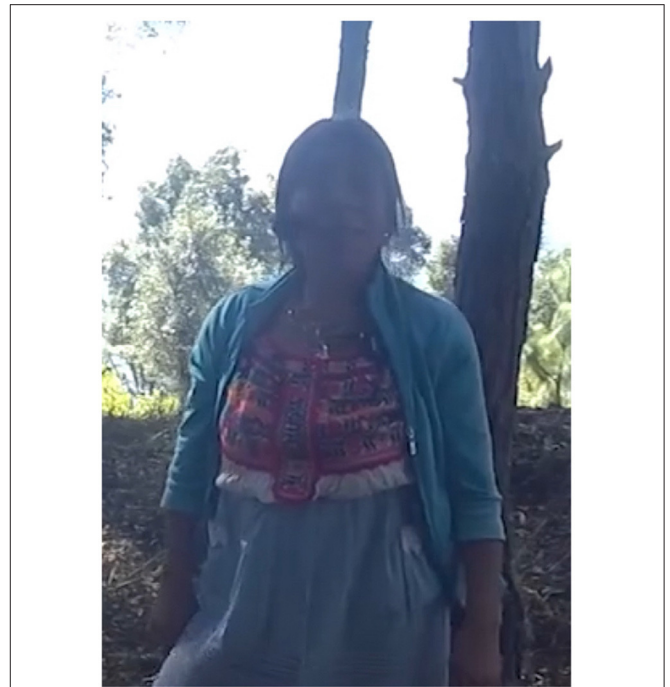
FIGURE 2 | Activity scale [target: Peak of kyqya C kcheq B ].