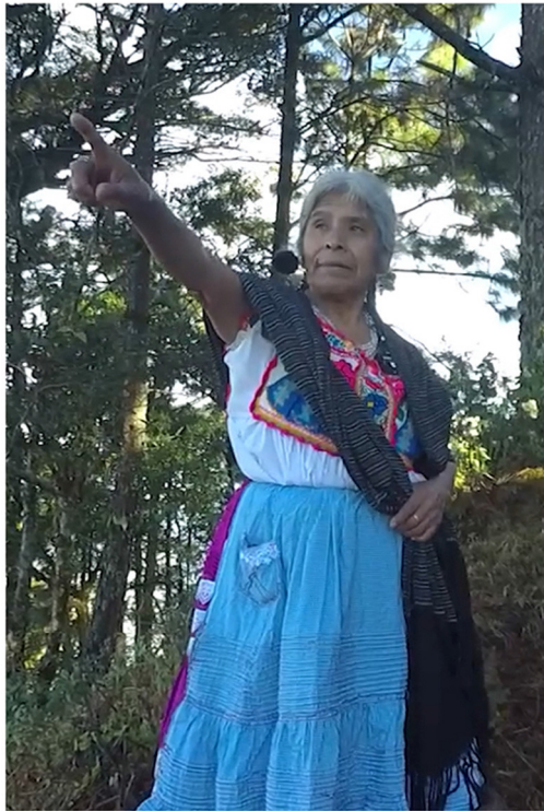
FIGURE 6 | State scale [target: Rio Grande].