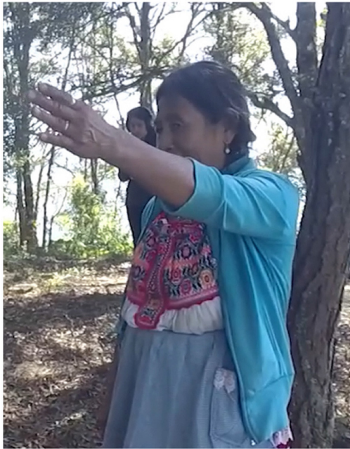
FIGURE 8 | Dem. + manual point [target: Oaxaca].

point. We propose, in line with Piwek et al. (2008) and Cooperrider (2011, 2015), that in this context the proximal demonstrative is indeed recruiting attention with greater intensity. We further suggest that the demonstrative is orienting visual attention not primarily to the target, but instead (and in some cases exclusively) to the more informative contribution of the speaker's gesturing body (for a similar suggestion, cf. Bangertner, 2004). Demonstratives have been shown to call visual attention to speaker's gestures that represent spatial features of a referent (such as its orientation in space, cf. Emmorey and Casey, 2001; Hegarty et al., 2005). Our findings suggest that demonstratives play a similar role in orienting speaker attention to the gesturing body, as well as the indicated target, during multimodal indicating.