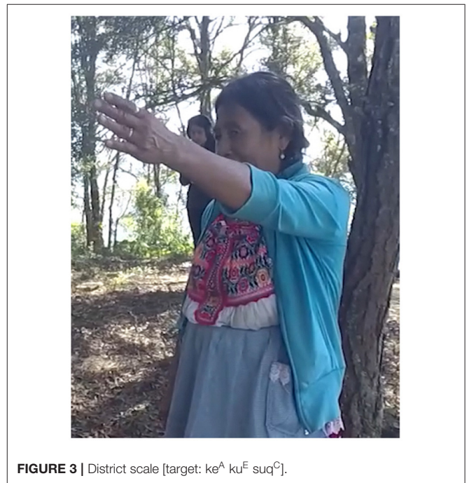
FIGURE 3 | District scale [target: ke A ku E suq C ].

targets, participants were more likely to point with a raised arm, and likelier still to do so when indicating state scale targets. These findings are illustrated in the examples that follow.