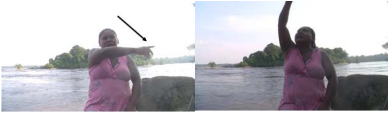
FIGURE 7. Unmodified and modified stimuli: GR6A (left) with appropriate time for ‘the day disappeared’ and GR6B (right) with a conflicting time reference.

In both stimuli GR6A (unmodified) and GR6B (modified), the speaker said ‘They went up (the river) and came back as the day disappeared’, but in the first she made an arc from east to west, while in the second she only pointed upward (see Figure 7). Since ‘the day disappeared’ ( ara ukāyemu ) is a common way of talking about nightfall, pointing to ‘noon’ was predicted to cause a semantic conflict in the modified stimulus. In line with the results discussed in §3.3, for the unmodified stimulus all nine participants produced a time reference sweeping east-west through the arc they had seen in the video. For the modified stimulus, by contrast, eight of nine participants also swept their hand from east to west, even though they had seen a different time reference in the clip.