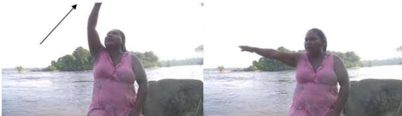
FIGURE 8. Well- and ill-formed stimuli: GR7A (left) with appropriate duration for ‘morning until noon’ and GR7B (right) with an inappropriate time.

The responses to GR7A and GR7B (Figure 8) show another instance of the same type of effect. The spoken element of the stimuli was the phrase ‘In the morning (s)he waited until noon’. In the unmodified stimulus the visual time reference was from the horizon until the sun’s zenith. In the modified stimulus the speaker pointed at the horizon but held her arm in position instead of raising it. In seven of nine cases participants faithfully repeated the visual/bodily elements of the unmodified stimulus, and in nine of nine cases they corrected the modified stimulus.