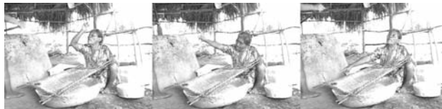
[<SWEEP ‘they dance’] [<SWEEP] [<SWEEP]