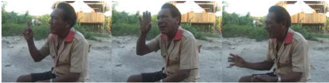
[POINT ‘as it was getting into afternoon’]

The time references occur together with specific types of spoken material, generally with predicates (like yande kuéma ‘it got light’) and predicate modifiers, often with deictic words ( ikeré kurasí ‘(when) the sun is still here’). While spoken adverbs usually modify through linear contiguity with a predicate, these time references have the possibility of simultaneous expression with a predicate or other spoken material. One way of looking at these time references is as one of several resources that combine to determine the temporal and aspectual semantics of the verb phrase (the ‘verb constellation’; Smith 1997). The two distinct ways of performing time reference—as a stationary point or as a sweep across the sky—contribute two different aspectual meanings: punctuality versus durability. When events are construed as instantaneous, such as killing a monkey in example 3 below, they tend to combine with stationary pointing (here with an open hand shape—possibly related to more general time reference versus a more precise one).