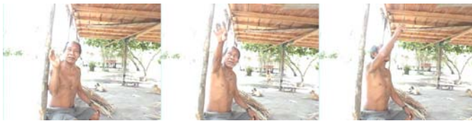
[POINT ‘it got light’] [POINT the ‘sun (is) still here’] [SWEEP> ‘until’][POINT ‘just here’]

Example 2 begins to illustrate the variety of types of cross-modal constructions observed in the corpus, showing a series of different time references in a sequential narration that covers an entire day. Some of the references are for specific moments and consist of stationary points, while others are for periods of time and sweep between two locations. Elements in the spoken line that are simultaneous with visual time references are marked with brackets.